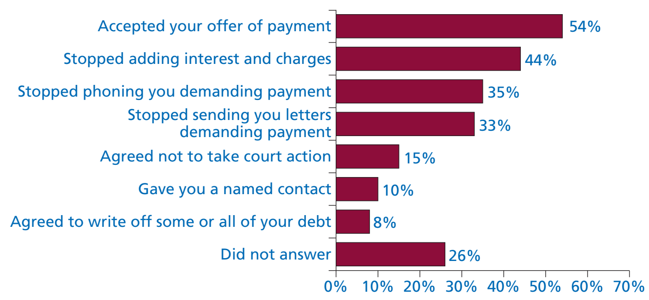
Chart 3: What positive response did you receive from your creditors?

Base: 1,042 responses to our online survey. Respondents were presented with a list of possible positive outcomes and asked to select all of those that applied to their own negotiations with creditors.